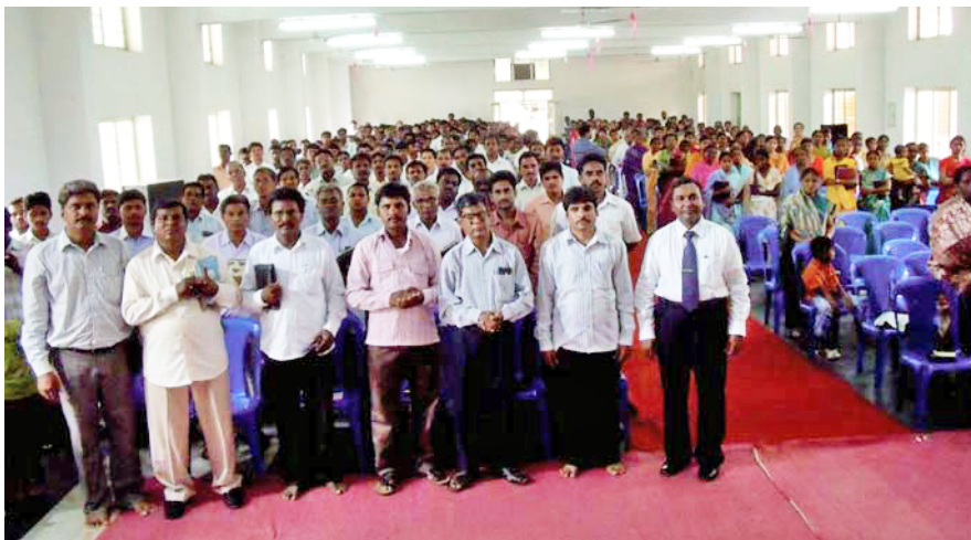
A meeting in India with many ministering brethren.