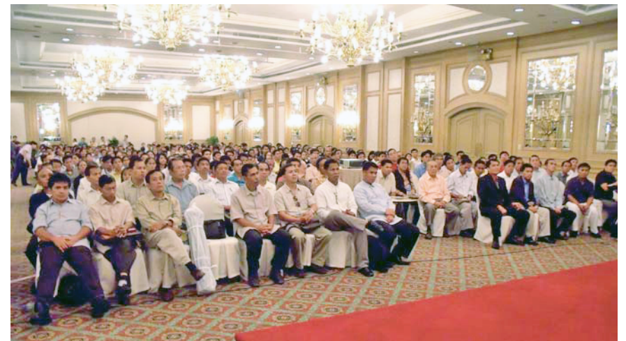
A meeting in the Philippines where also many preachers participated.