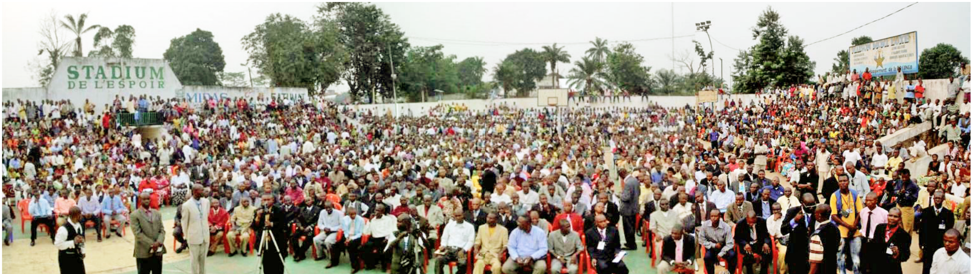
One of the many meetings in Africa.